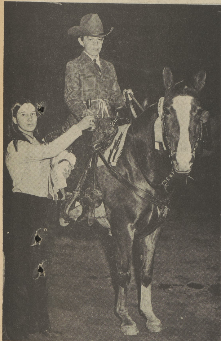
The Dallas Post