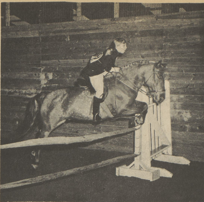
The Dallas Post