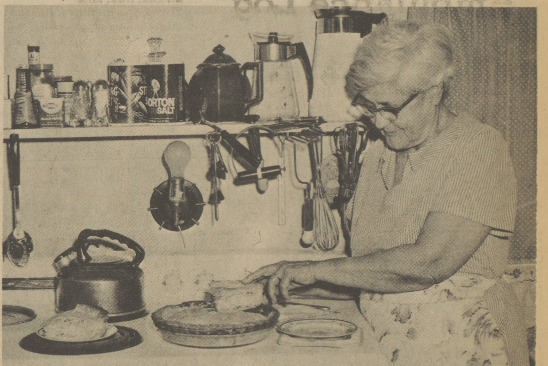
The Dallas Post (ALEX REBAR)