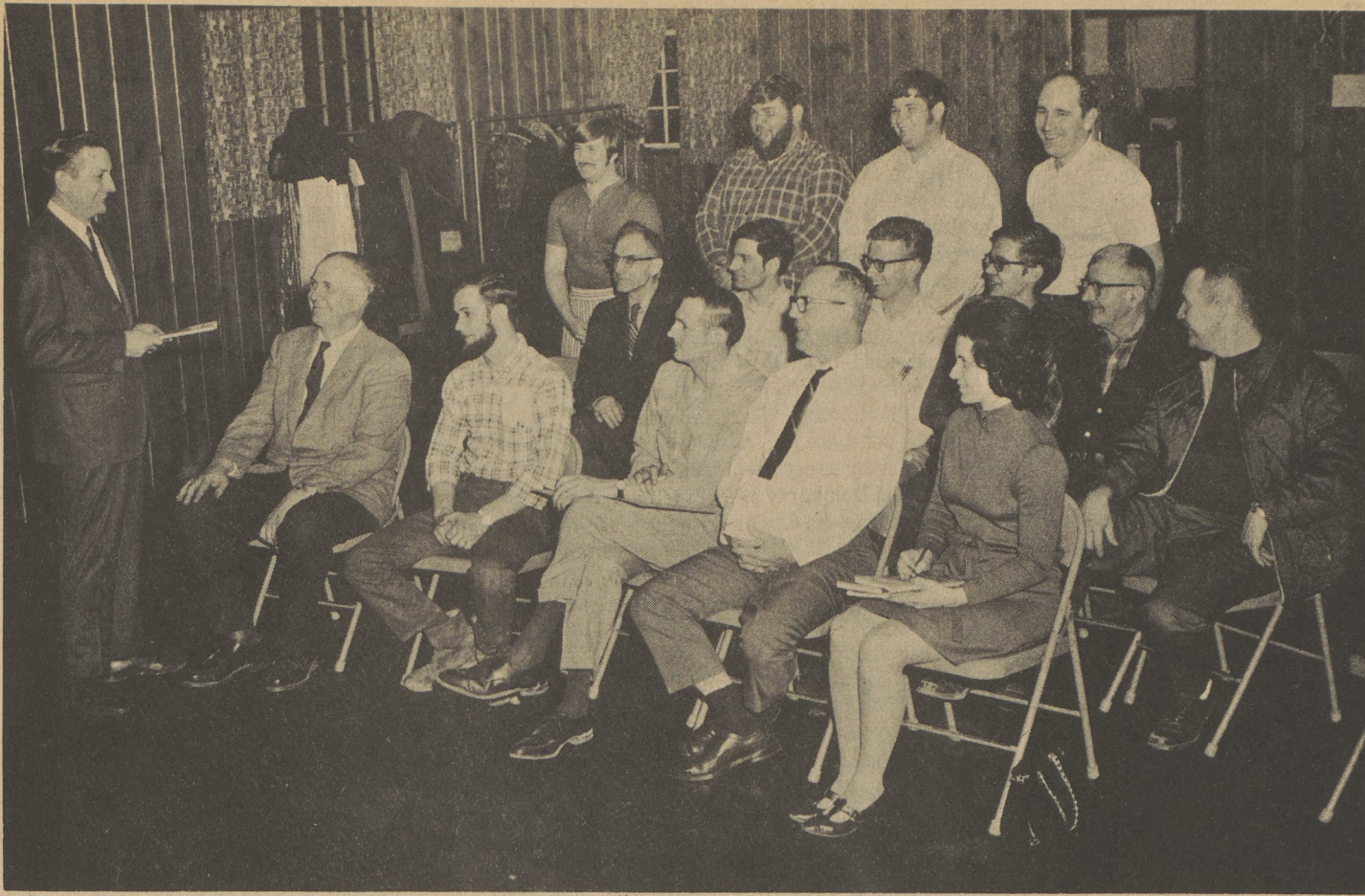
The Dallas Post (ALEX REBAR)