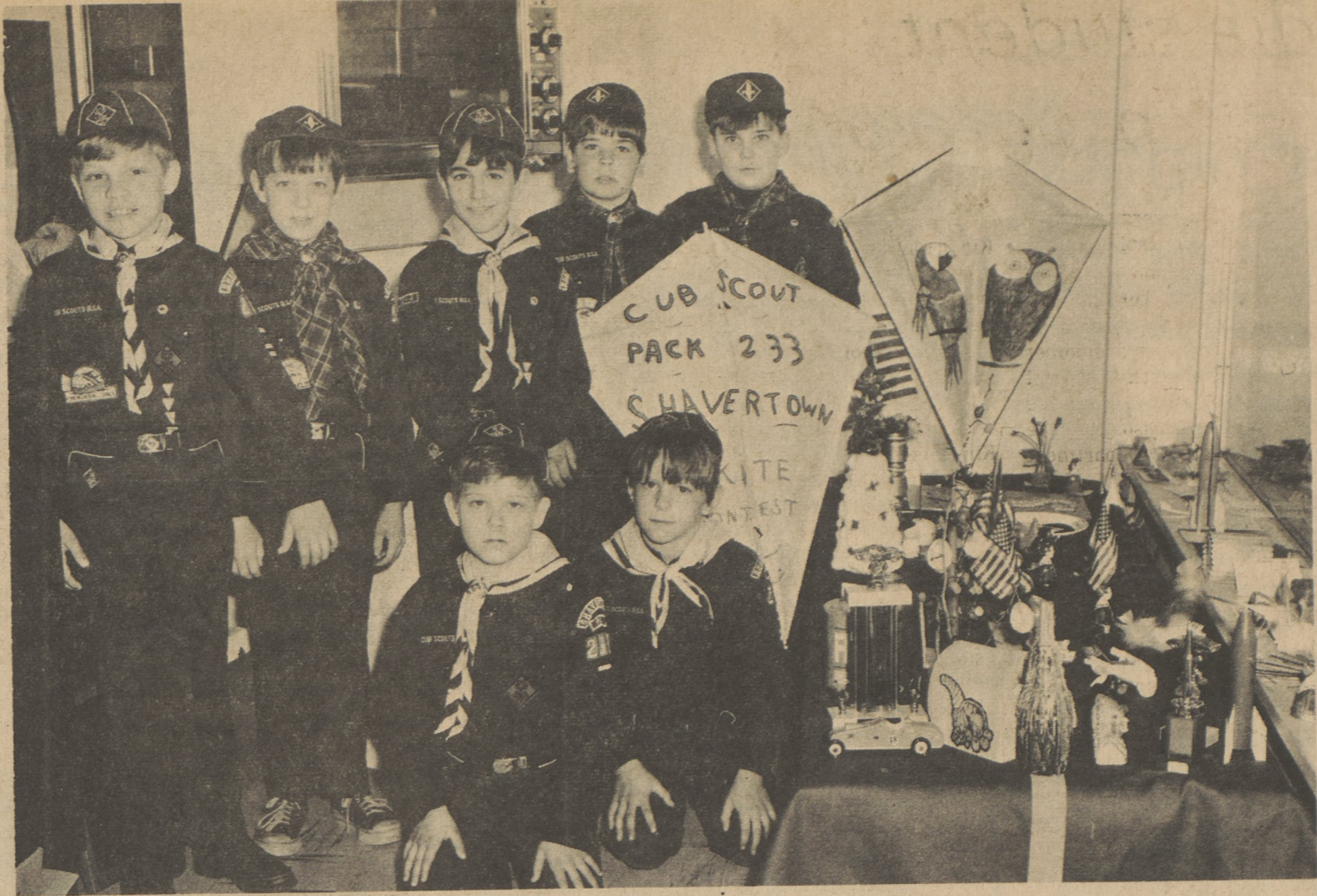
The Dallas Post

Northeastern Pennsylvania Town Meeting of the Air will be telecast live from the studios of WNEP-TV Channel 16 before an audience of approximately 200 people representing civic and political leaders, board members of welfare and social organizations and administrators and workers in the welfare program, as well as the general public. Viewers will be able to participate directly by calling special phone numbers to ask panelists specific questions.