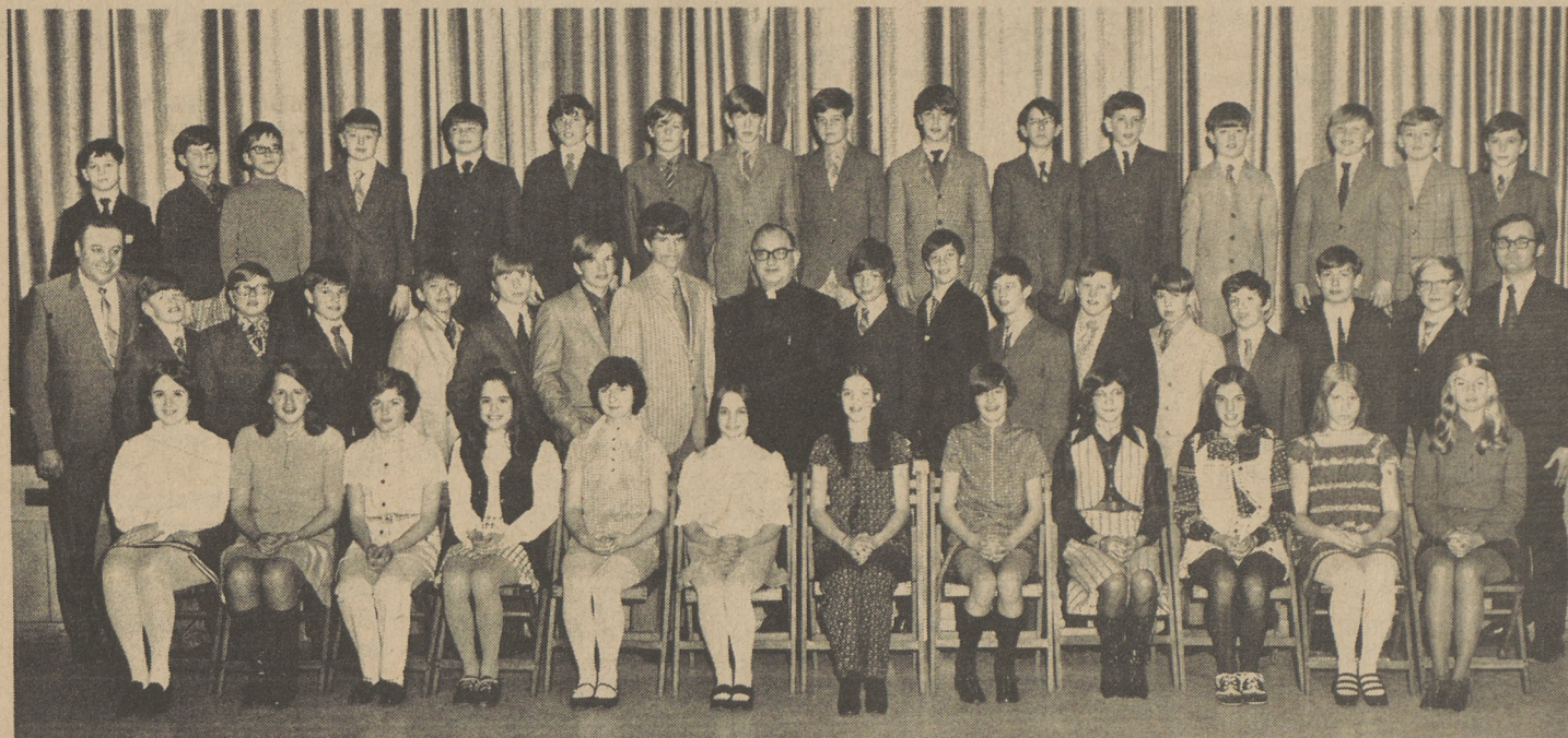
The Dallas Post (ALEX REBAR)