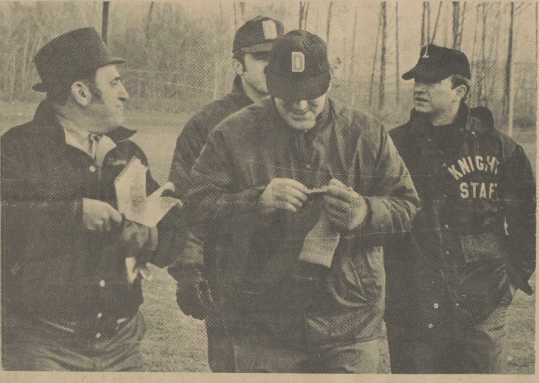
The Dallas Post