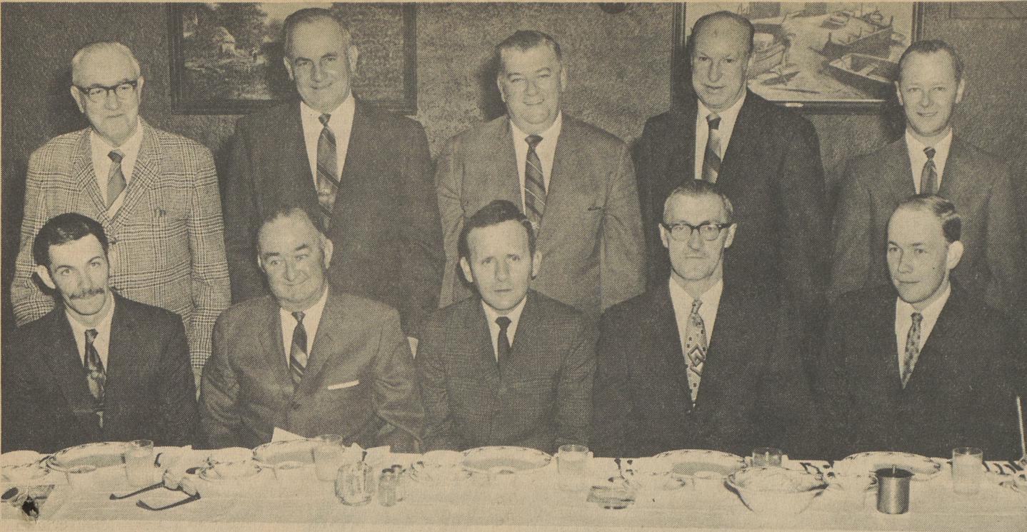
The Dallas Post (ALEX REBAR)