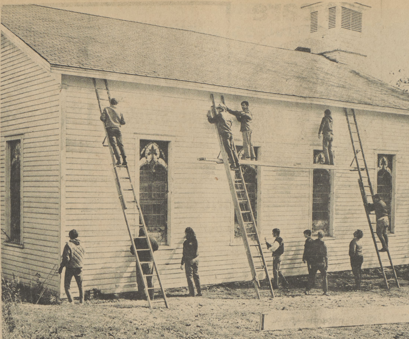
Undaunted by Saturday's near freezing temperatures and early morning snow flurries, these Penn State students and faculty members scraped away old paint from the Maple Grove

The recreation class will resume next week.