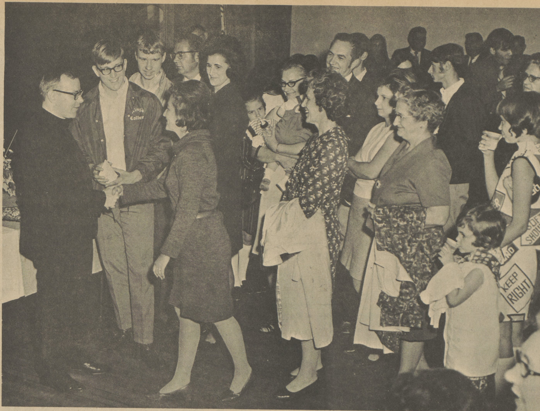
The Dallas Post