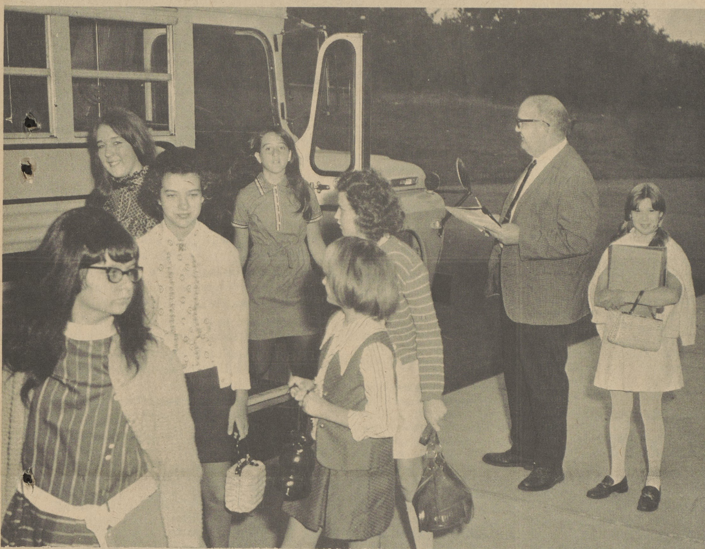
Dallas Post (ALEX REBAR)