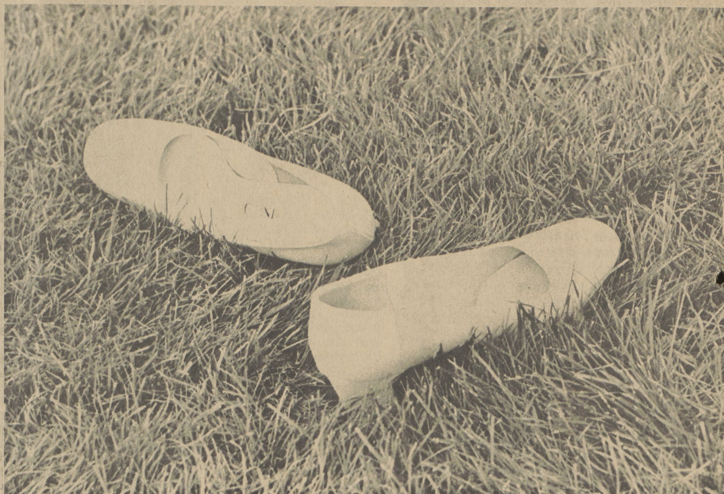
With a rock band warming up soon after the nuptial ceremony, it didn't take the bride long to join her husband on the dance floor. In the process she left behind part of her wedding costume, two articles unneeded for the outdoor reception.

The bride selected an ivory silk Peau de soie gown for her wedding fashioned with a scooped neckline and bracelet-length sleeves superimposed with princess lace. The high-rise bodice, outlined with a wide self belt, complemented a full skirt adorned with matching lace appliques extending into a