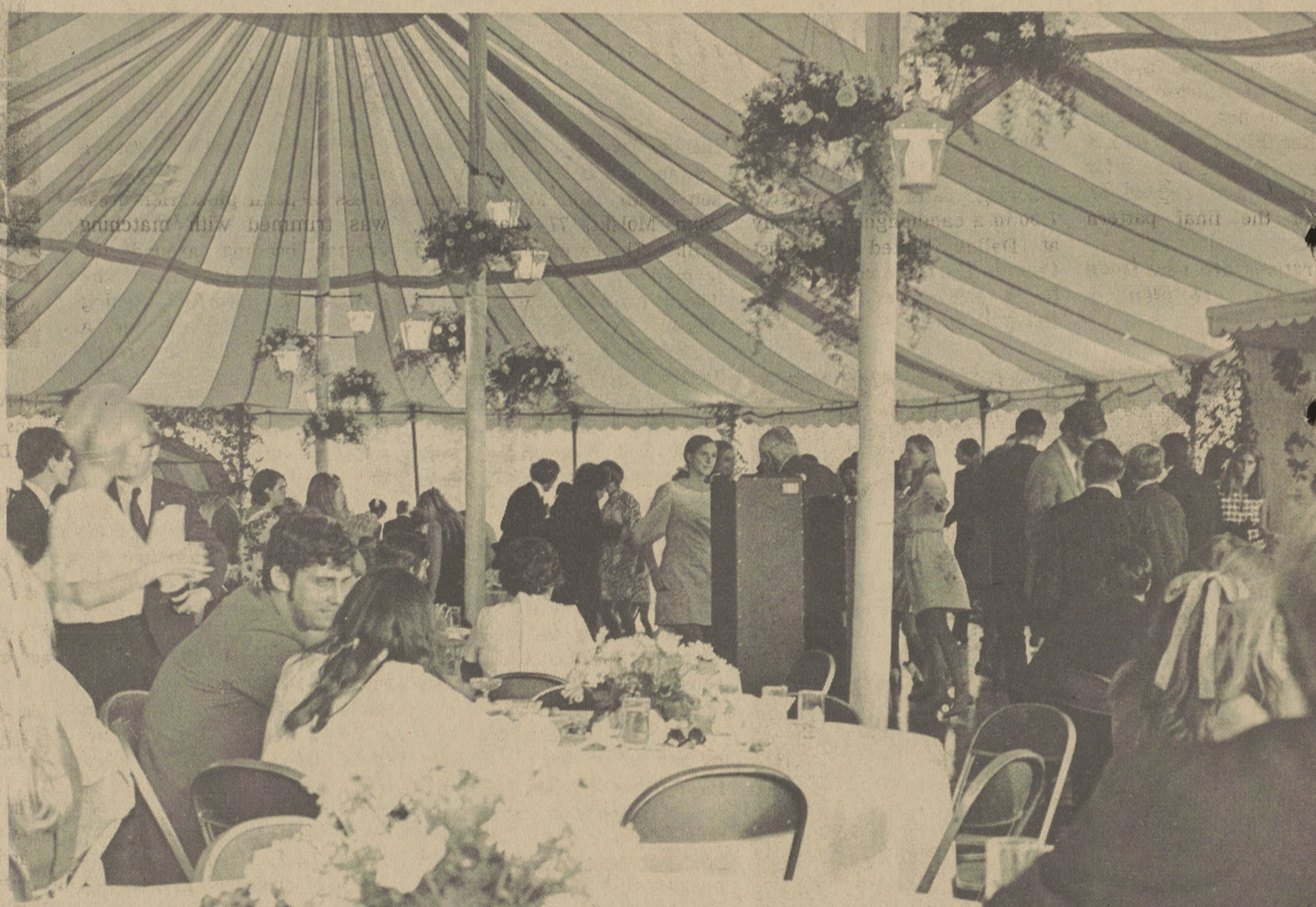
Wedding guests of about 500 begin warming up to the rock sounds from the huge gala-colored tent on the front lawn of the palatial Scranton estate.