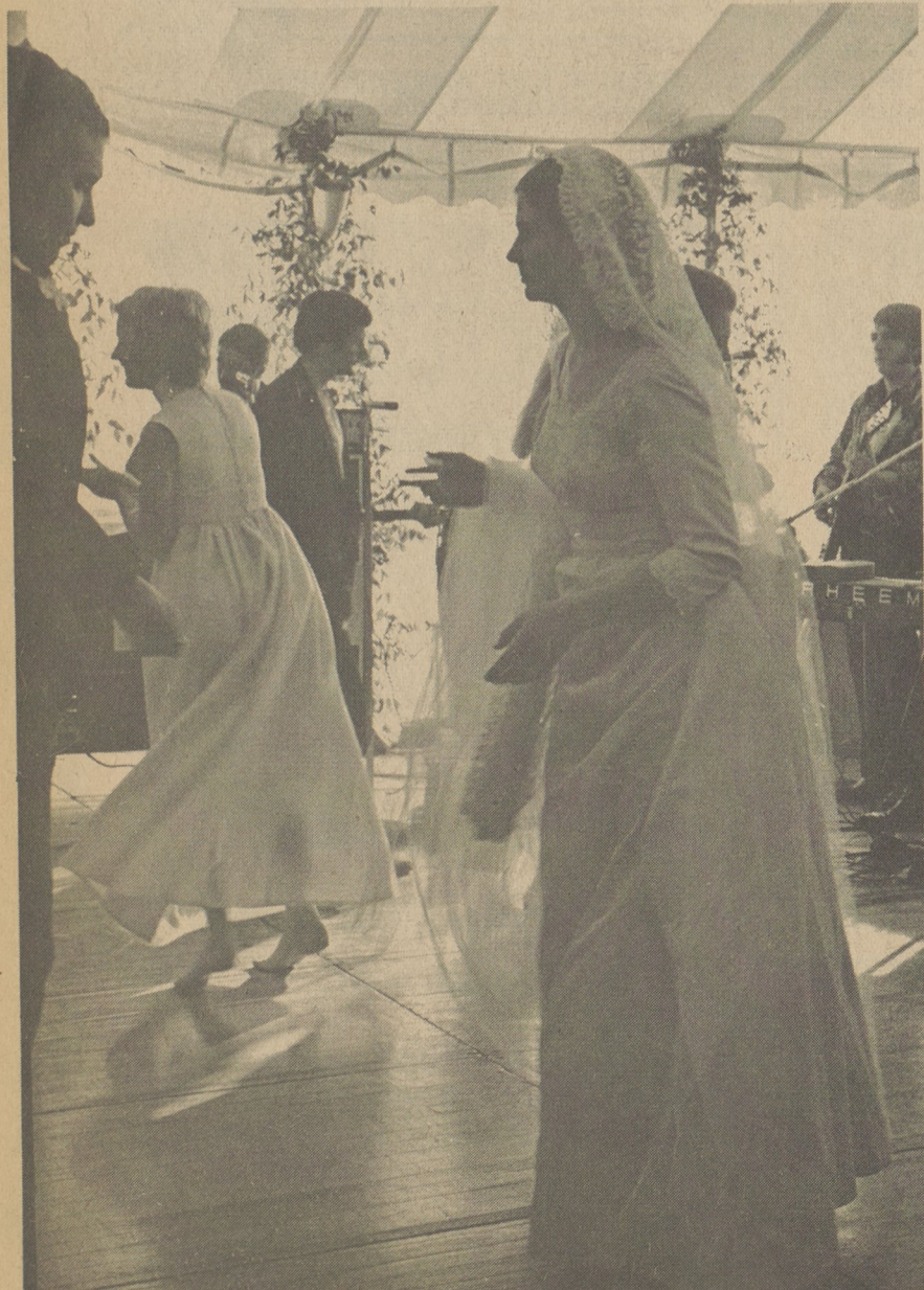
The bride steps to the modern rhythm, joined by one of her attendants, who apparently decided to join her escort without shoes.