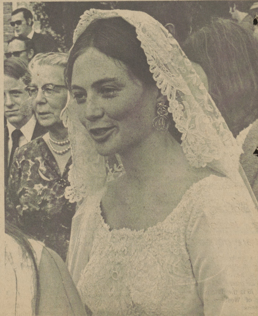
The bride chats with guests prior to her honeymoon departure to Europe.