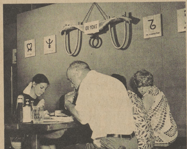
The Perfect Place for Family Dining—Seven Days a Week!

#1 Giant T-BONE STEAK Buttered baked potato, Fresh green salad and Buttered garlic roll $2.99