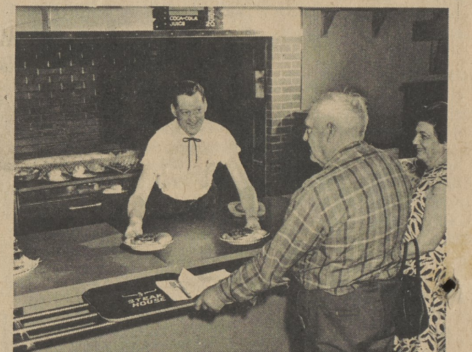
"Come As You Are" Save Money! And that's no "Bum Steer!"

Congratulations and Best Wishes for Continued Success from —