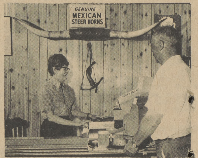
All Steak orders CHARBROILED to your order right before your eyes!