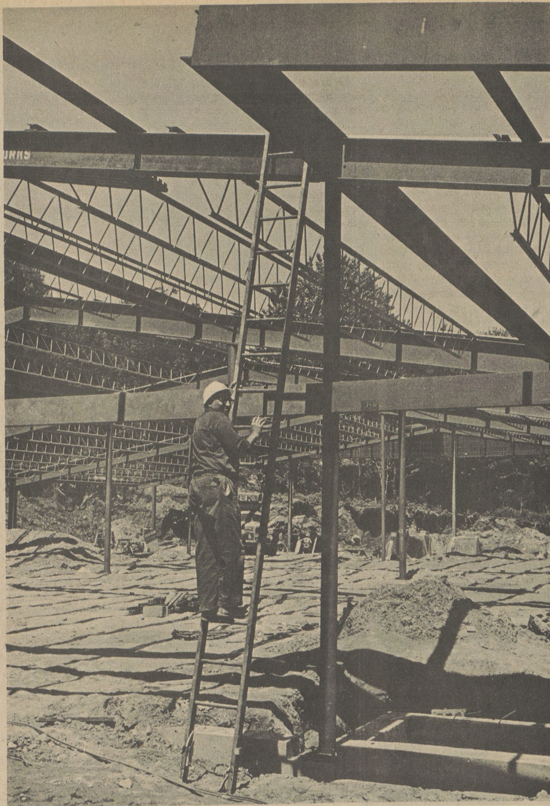
Worker climbs ladder at construction site of new Dallas Acme market. Steel work went up last week.