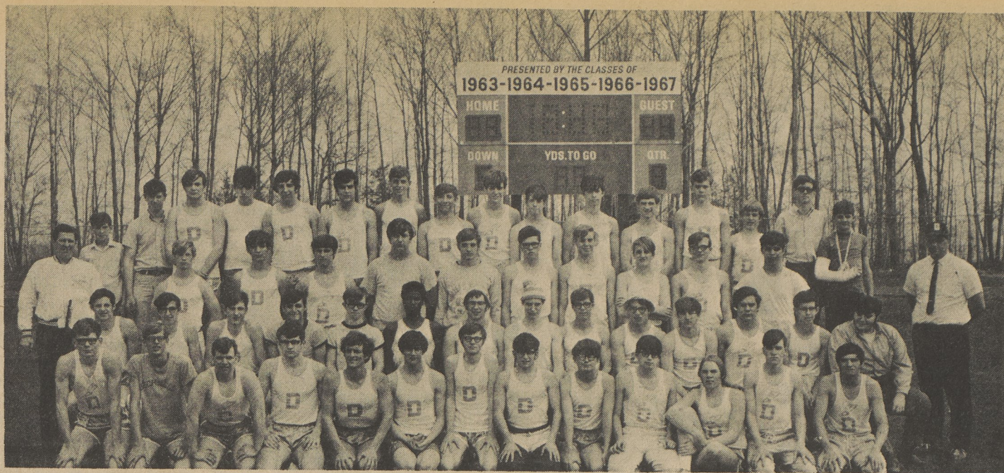
The Dallas track team, District 2, Class B, champs, are pictured above.