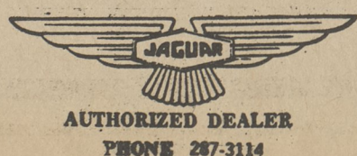
AUTHORIZED DEALER PHONE 287-3114

MIDWAY Auto Sales 2010 Wyoming Avenue, Wyoming Sales Service