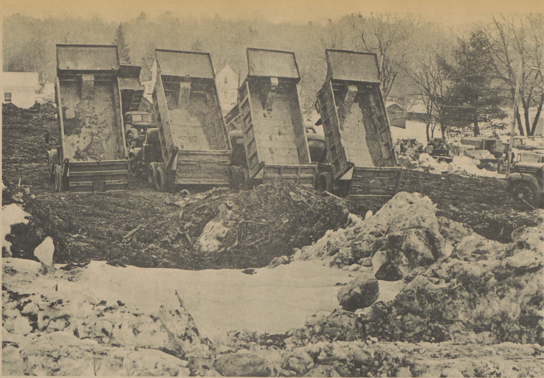
Dump trucks stand empty at the end of a working day on the excavation site of the new Acme on Church Street, Dallas.

The first area to be developed is in the southern section which lies in Dallas Township. The remainder of the site is partially in Franklin Township. Plans have been submitted to Dallas Township for a zoning variance to build the mobile park and a few stores to serve the community. There will be a hearing before the Dallas Township Planning Commission Feb. 16 in the Dallas Township Municipal Building.