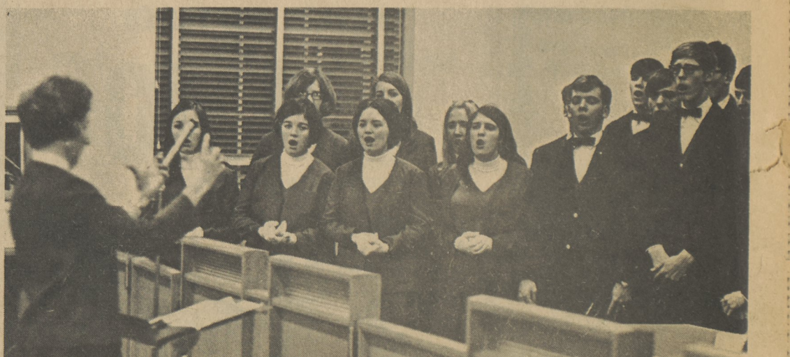
Dai-Hi Choristers appeared at the United/Penn Bank in Dallas Friday where they sang selections from the program they will present at the Christmas concert Sunday, Dec. 14, at the high school.