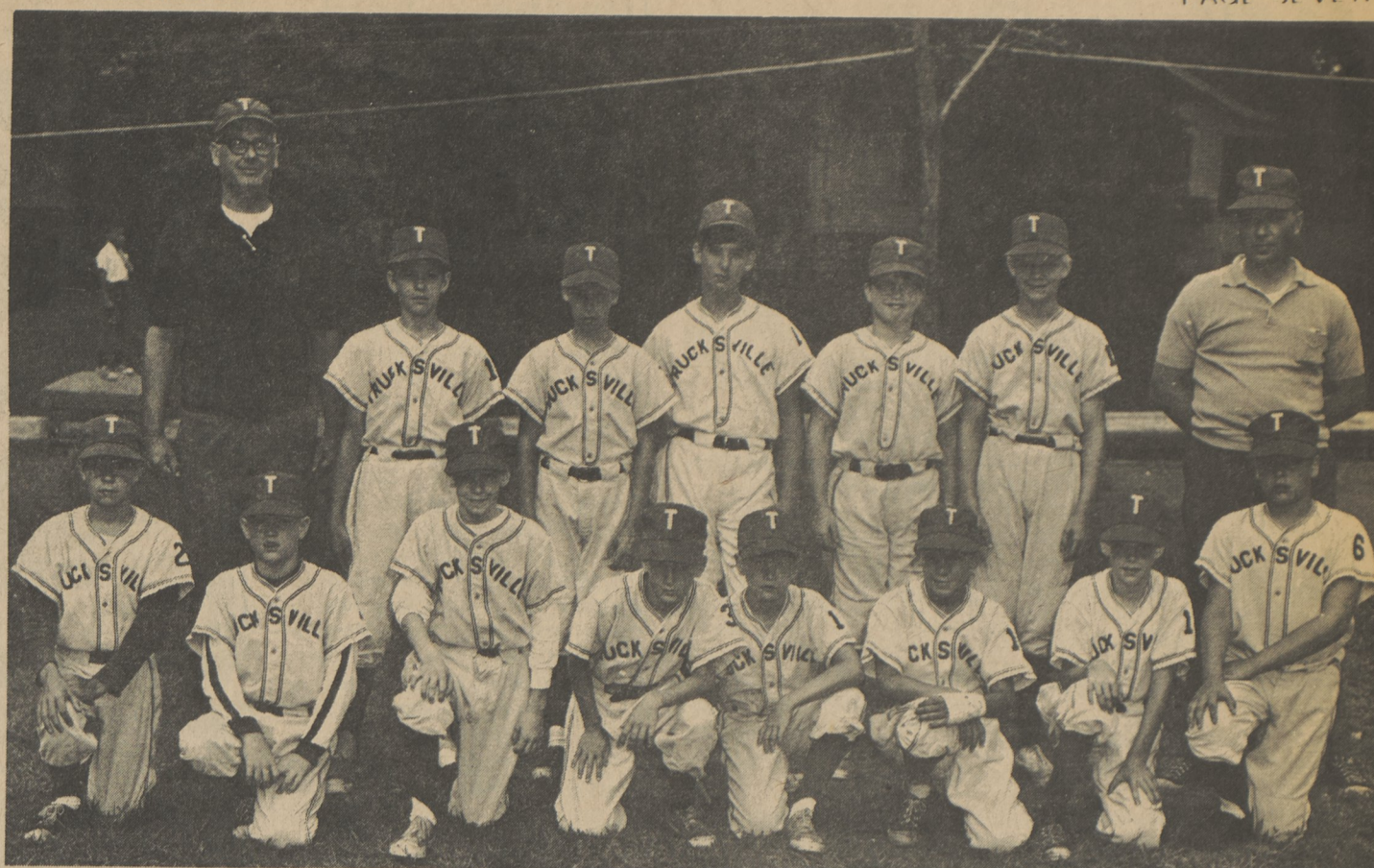
The Trucksville team finished the Back Mt. Little League season as Major League champions after defeating Fernbrook 4-2. The champs sought revenge on the Fernbrook boys after losing their only game to them during the first half of the season.