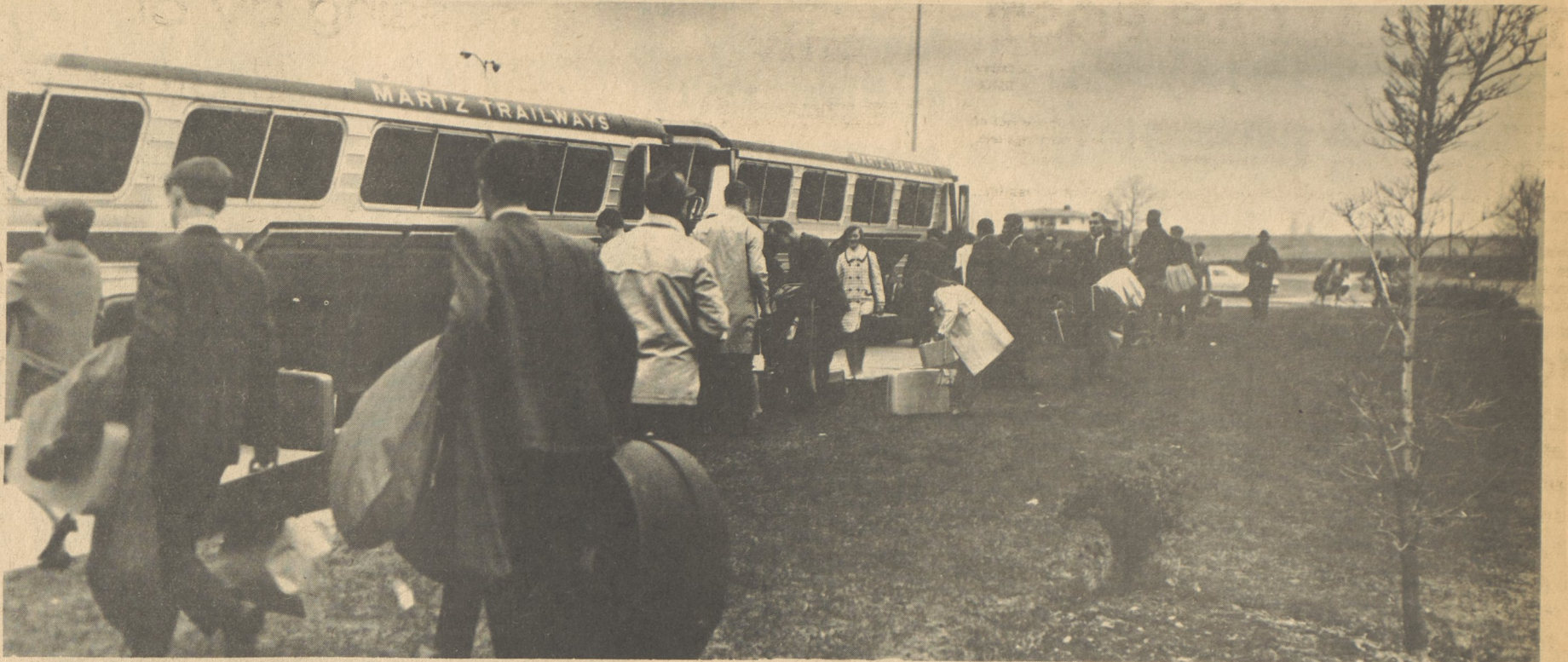
Lake-Lehman band members early last Friday morning boarded four buses to travel to Washington where they will participate in the Cherry Blossom Festival.