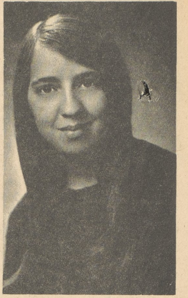
Winners of the Semi-Finals will compete in the Finals to be held at a later date at Trem Temple Auditorium, Wilkes-Barre. The contest is sponsored by the Kiwanis Club of Dallas.