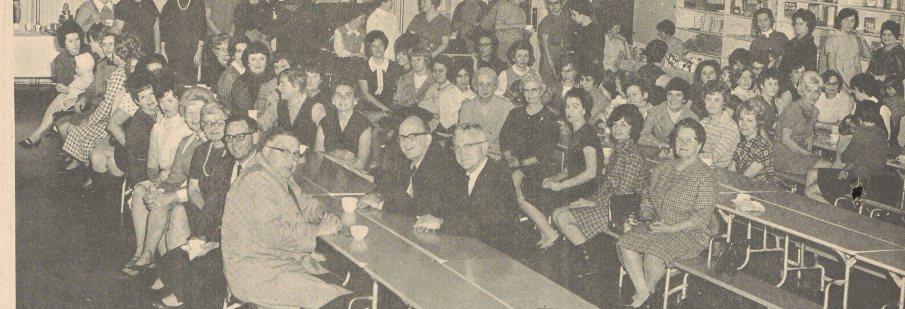
Holiday Fair is Thursday

The Holiday Fair sponsored by the Shavertown Branch of the Nesbitt Memorial Hospital Auxiliary will be open from 11 a.m. to 8 p.m. today (Thursday), at the nurses' home adjacent to the hospital on Wyoming Avenue in Kingston.