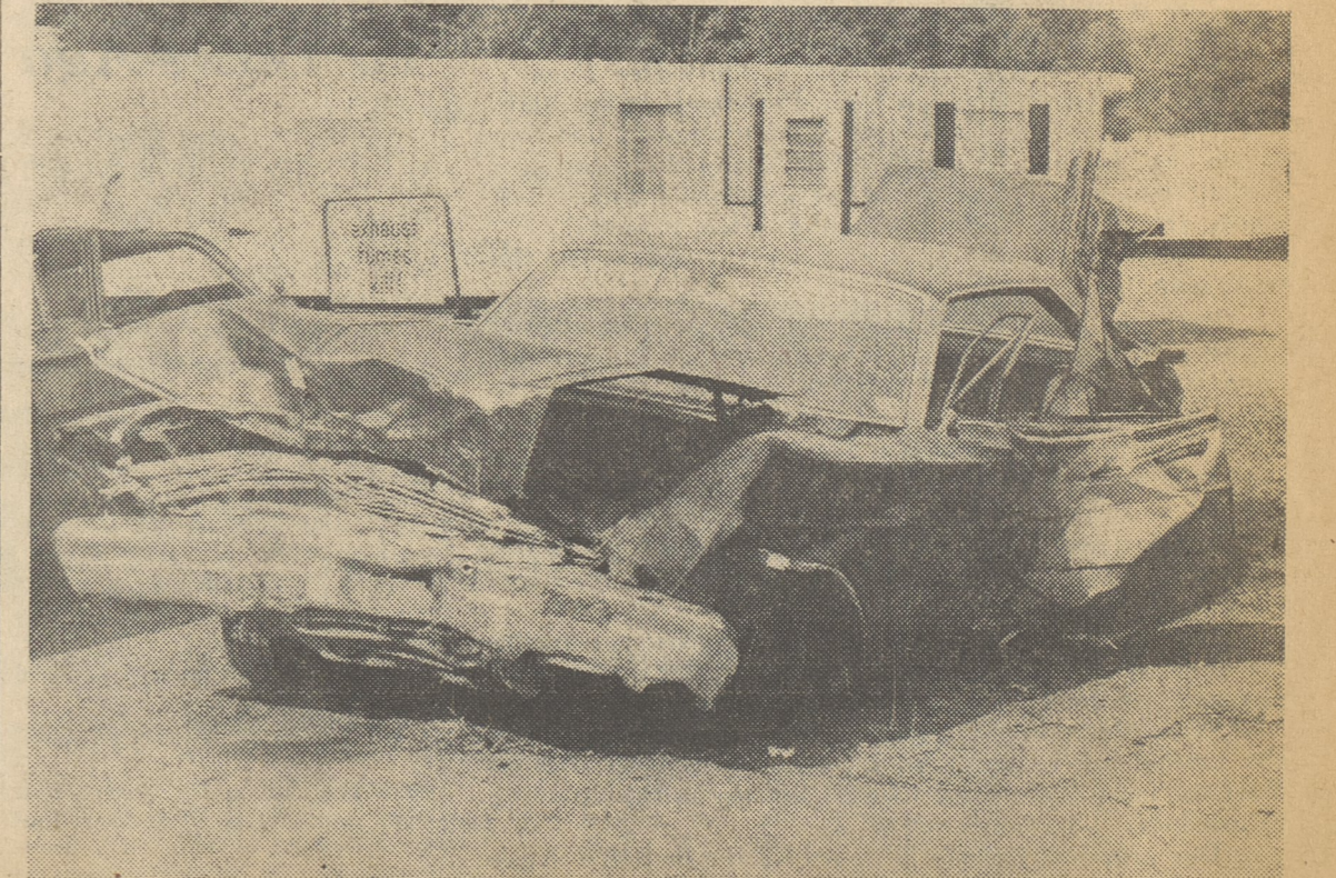
A sign proclaiming "exhaust Esso, ironically draws attention to young Dallas man on Memorial fumes kill!" near Birth's Dallas wrecked car that ended life of a Highway early Saturday night.