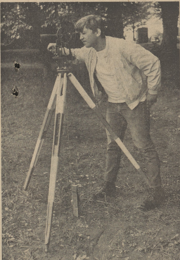
The student with the surveyor's transit, sighting through the telescope.