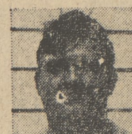
Jim Thorpe