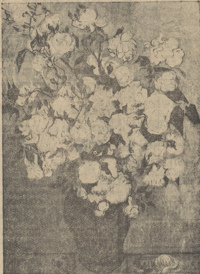
WHITE ROSES - VINCENT VAN GOGH

Here's a chance for you to save twice. Start a savings account and at the same time build a collection of exquisite paintings . . . works of Van Gogh, Renoir and other greats. We've turned our lobby into an Art Gallery, so you may see for yourself the wide variety on display. Each is a meticulous replica painting of an original masterpiece (18 x 24 inches large) mounted on a wood stretcher like any painting from an established gallery.