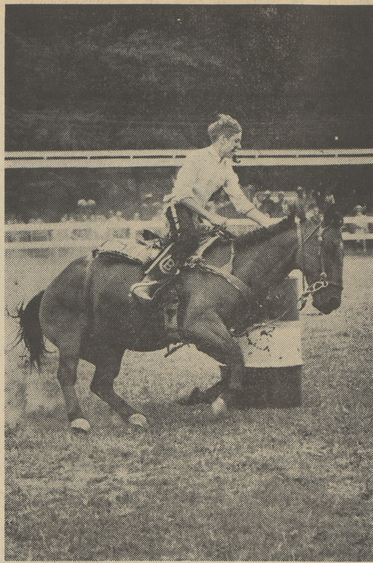
You'll see action like this at the 23rd annual Lehman Horse Show, July 2 to 4, with the western events such as the Barrel Cutting