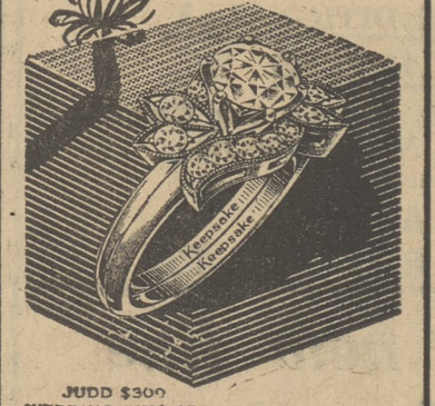
JUDD $300 WEDDING RING $150

Reflect your good taste with an exquisitely styled Keepsake... the ring with the perfect center diamond.