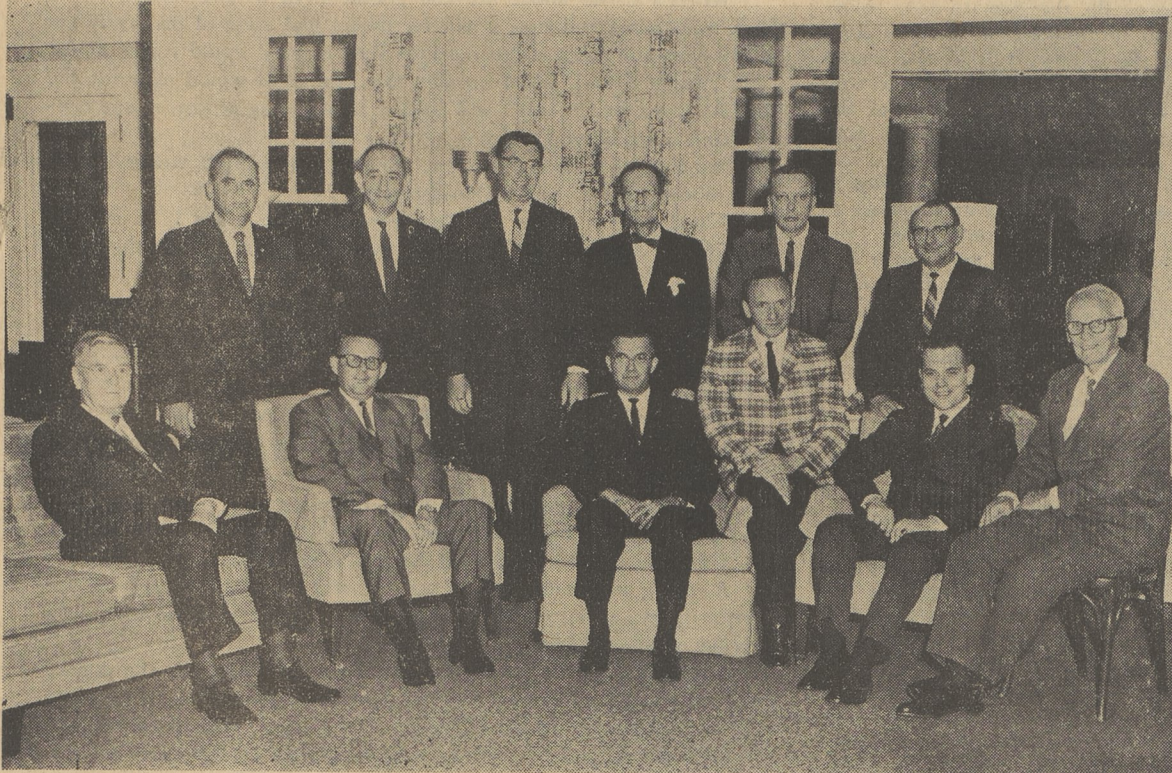
Installation of officers for the year 1966-67 for Dallas Rotary took place June 30th at Irem Temple Country Club.