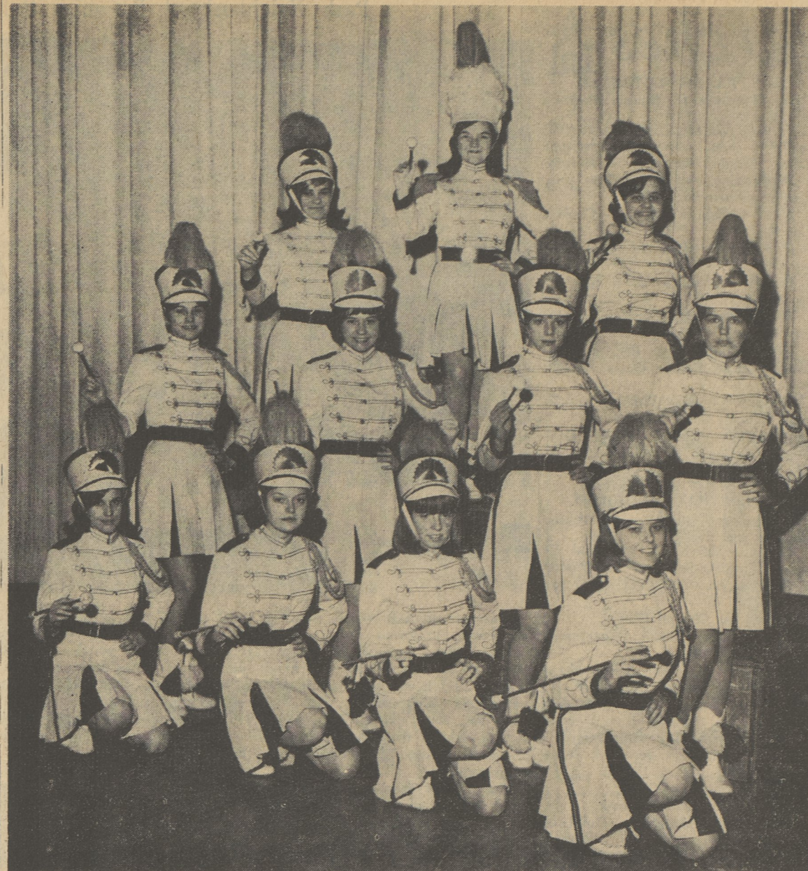
The Dallas Senior High School Band will present its annual spring concert on Friday, March 18. The majorettes will be featured in two numbers—Salute to P.M.E.A. March and United Nations March.