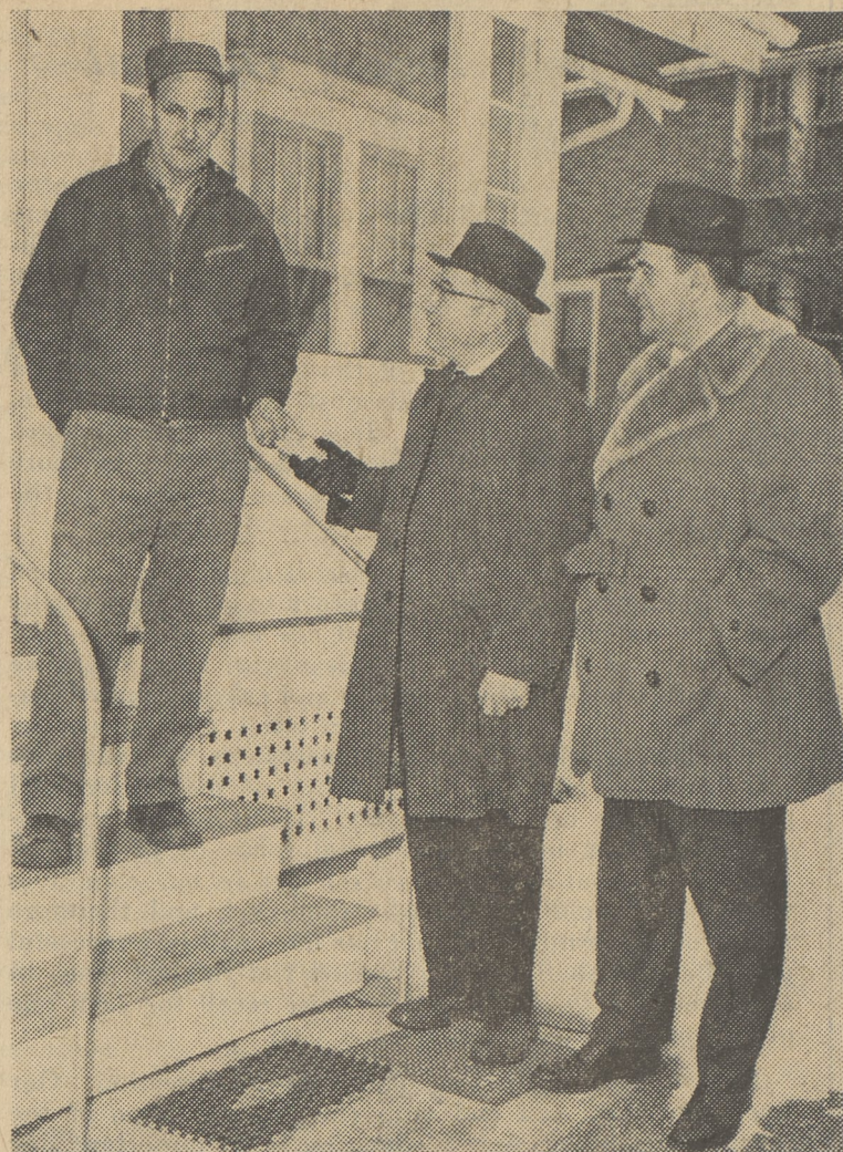
The members of the Dallas Rotary Club are busily engaged these days in preparations for their annual traditional turkey dinner to be held on Saturday, February 26th at the Dallas Senior High School, serving commencing at 4:30 p.m.

Dallas Rotarians prepare the meal and serve it with a great deal of finesse having operated this community activity for the past twenty years. Local folks look forward to this social event each year. Rotary Anns will conduct a bake