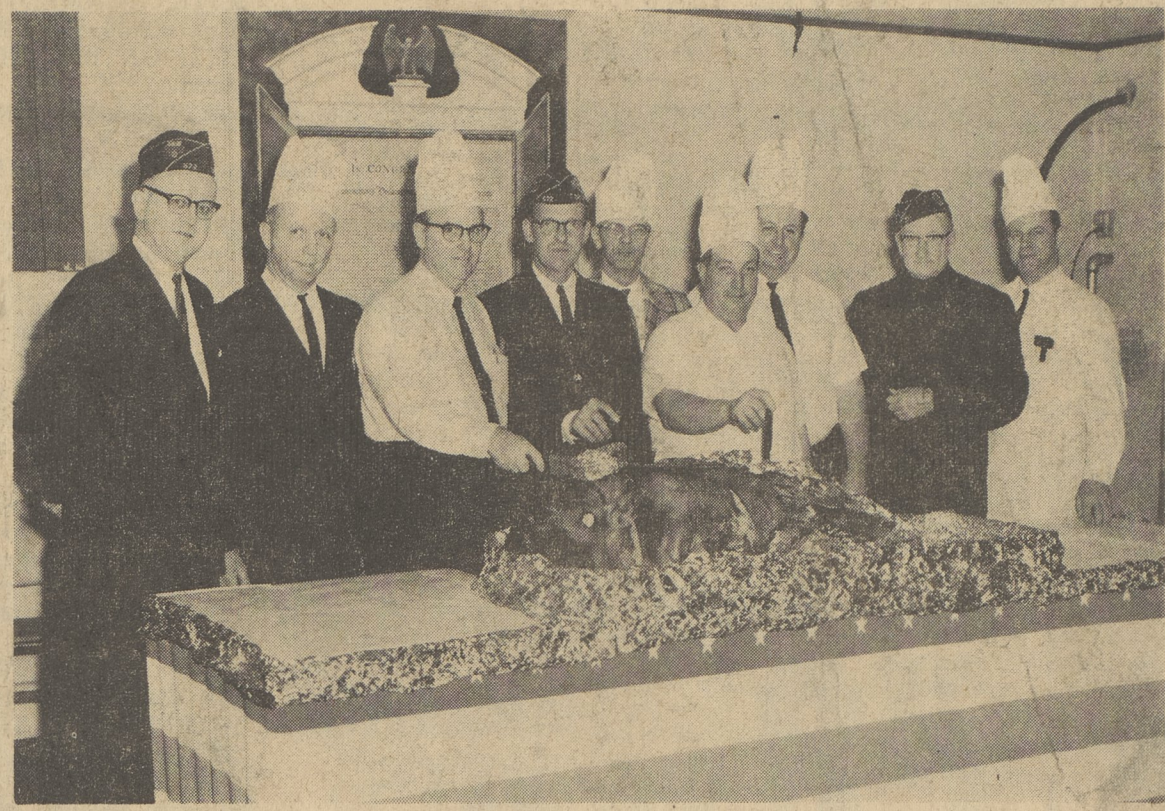
Ready to get down to business and go whole hog are these smiling Legionnaires of Daddow-Isaacs Post 672.