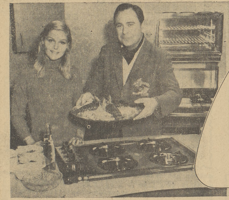
Guest star, Carol Lynley, will appear on program demonstrating her favorite recipe.