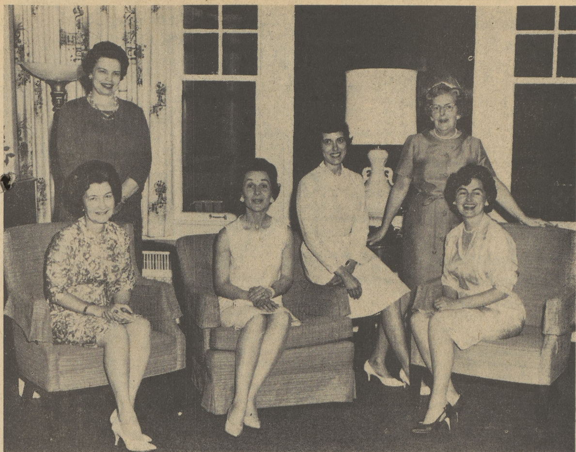
Women of Rotary installed their 1965-66 officers at a meeting at Irem Temple Country Club Friday night, June 4.