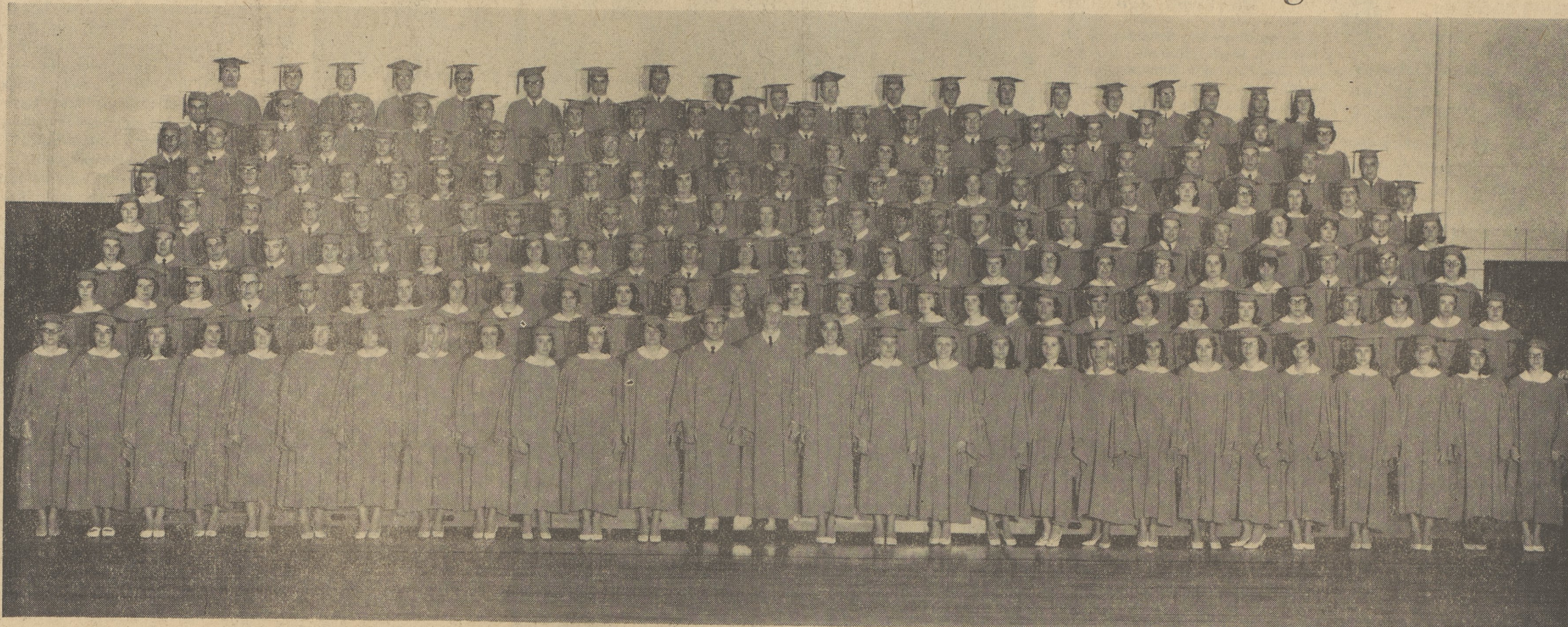
Dallas High School held commencement exercises for its seniors at the high school on June 8.

Of this number, 115 intend to go on to further study, eighteen are going into the service, eight are undecided about future plans. Going directly to work, 57 seniors.