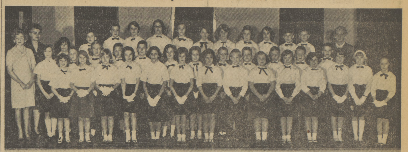
Dallas Elementary Chorus Wins 2nd Place In Esteddfof