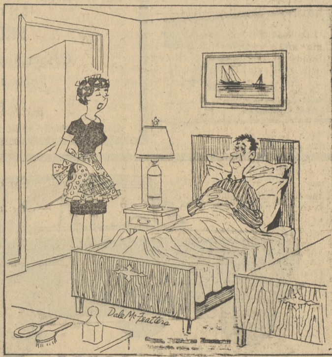
"I'm glad you don't feel up to going to the office today - the basement needs cleaning."