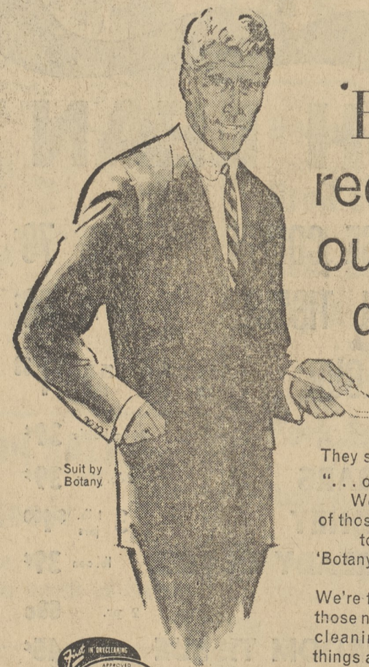
Suit by Botany

Huston's Feed Service Call 674-6191 Fernbrook