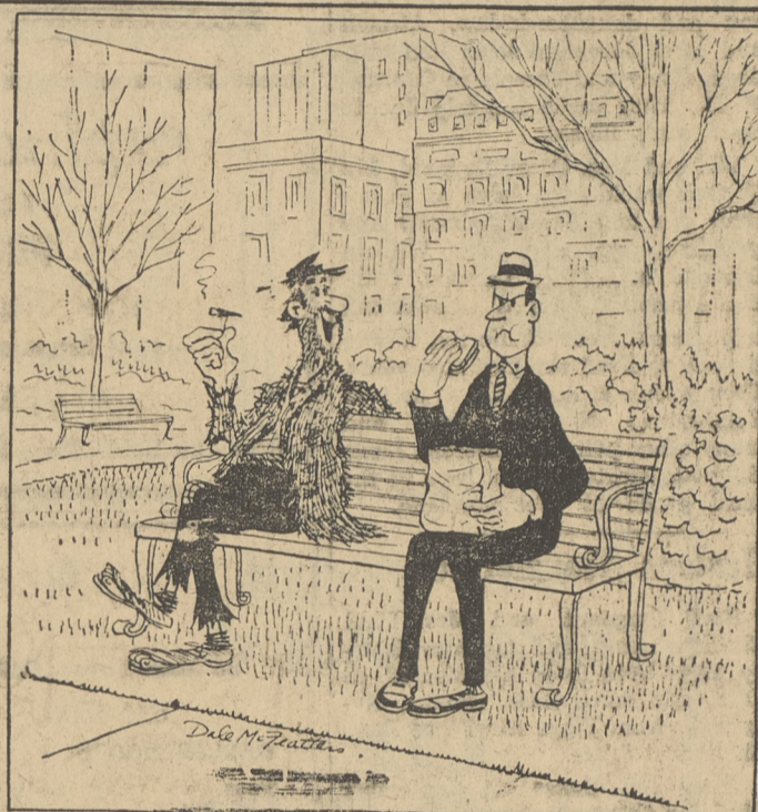
"Victim of the new expense account rules?"

For Prompt, Efficient, Clean GARBAGE & TRASH REMOVAL