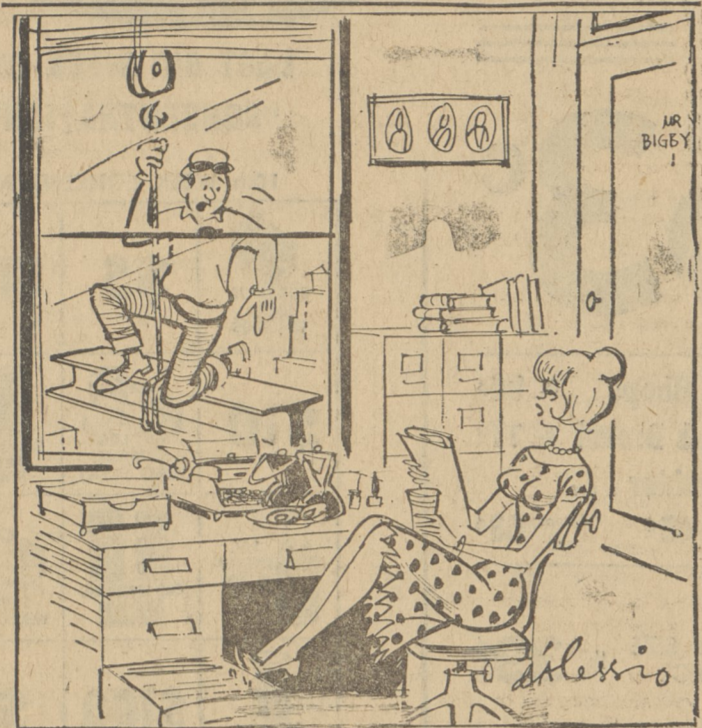
"Better get back to work, Miss — your boss is on the way up!"