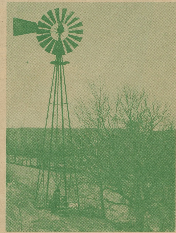
Shown above is the picturesque windmill in Lehman owned by the Burton Major farm. It is still in operation and delivers quantities of water for use on the farm.

Kites and windmills, they spell spring, but both are getting hard to find. Children don't seem to fly kites any more, and windmills have been replaced with submersible pumps or a hook-up to the city water