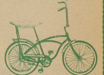
DELUXE STING-RAY Newest Fun Bike For 1964