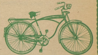
JAGUAR Finest Fully Equipped Middleweight