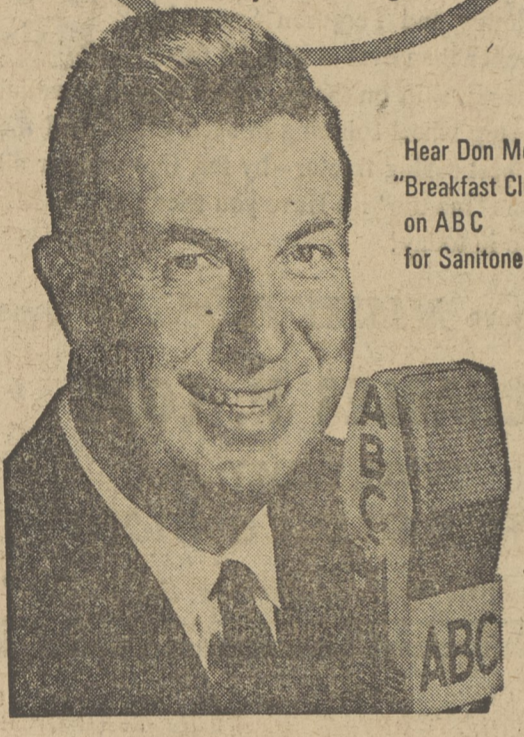
Hear Don McNeill's "Breakfast Club" on ABC for Sanitone

"This is it... the best drycleaning I've found," says DON McNEILL of our Sanitone Drycleaning