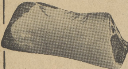
A TYPICAL A&P HALF PORK LOIN

A&P'S HALF PORK LOINS CONTAIN THE ENTIRE TENDERLOIN AND WILL WEIGH 5 OR 6 POUNDS.