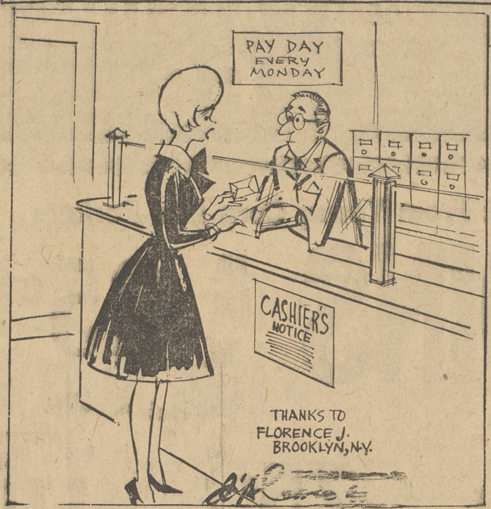
"Please, Mr. Bower — from now on, keep my salary and just give me the deductions!"