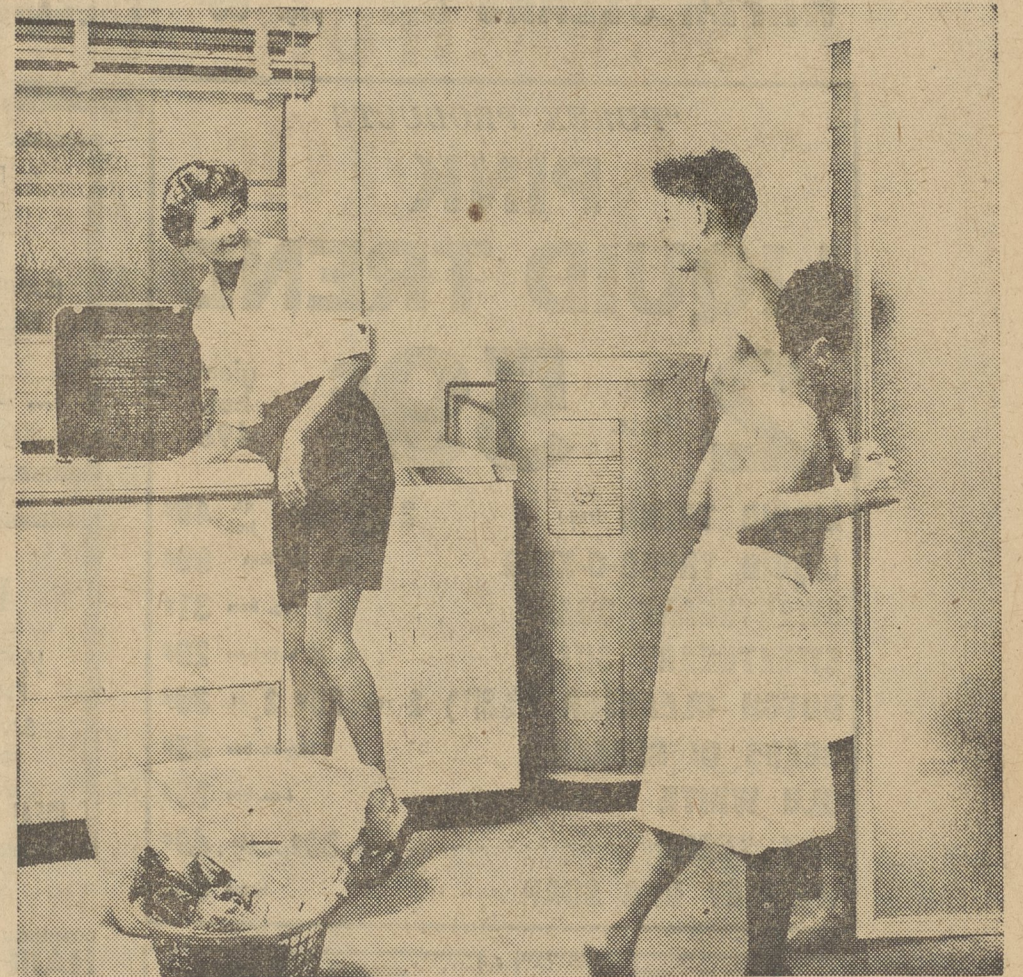
HOUSEWIFE'S DREAM COME TRUE! This quick-recovery electric water heater supplies plenty of instant hot water for home laundry and family showers at the point of use without long, wasteful plumbing runs. Electric hot water heaters are convenient and can be installed anywhere as shown in this utility room.

A customer using an ELECTRIC WATER HEATER, where all energy is billed through one meter, will now get 400 KWH at 1c per KWH instead of 300 KWH at 1c per KWH under the former residential rate, and the low cost 1c electricity will be available after using 200 KWH per month instead of 300 KWH.