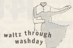
waltz through washday with a new automatic washer and dryer

The "Lady Kenmore 800" Soft Heat dryer is available in both gas and electric models exclusively at Sears, Roebuck and Co.