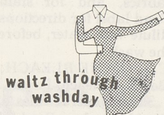
waltz through washday