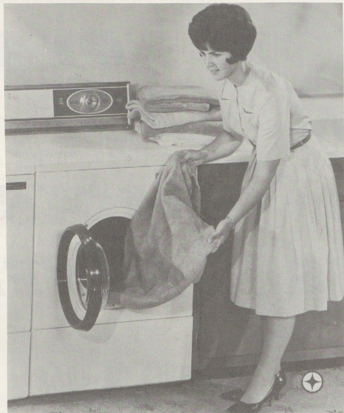
SINGLE DIAL controls of Philco-Bendix dryer are color coded for easier identification of cycles.

When he joins the home team, he stays in action for a long time because he comes from a long-lived family. He's guaranteed for ten years, but many electric water heaters in his family are still supplying the household's hot water needs after 20 years or more.