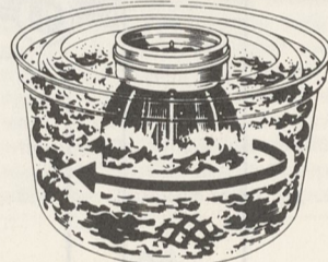
The Kelvinator "Golden Touch" agitator moves with an eccentric motion in one direction only.

has no gears to go wrong. We know you're too busy to put up with washer breakdowns. That's why we eliminated the biggest single cause of washer failure, the gears. Result? The simplest, most dependable mechanism you can imagine. You'll never have to pay a $70 bill for gear repairs when you choose the remarkable new Kelvinator with the Golden Touch. It's a product of American Motors ingenuity, an example of the imaginative approach to better living that developed Rambler automobiles. Kelvinator is built better to last longer, engineered to do a better washing job and keep right on doing it year after year after year. That's why Kelvinator can offer such a generous guarantee.