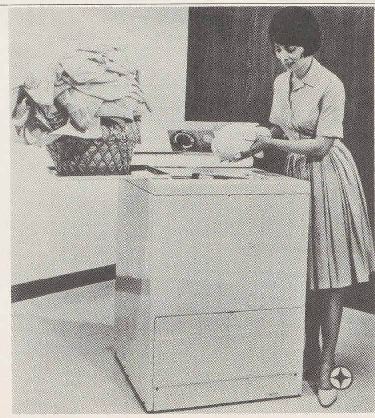
NORGE automatic washer is designed to launder a handful or a basketful equally well.

their ingenious uses with us. We have letters from all over the United States with these "plus item" drying ideas So we thought we'd like to share some of these "plus" uses with you. This is the answer to our ques-tion—"When is a dryer more than a dryer?"